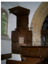
Two-decker and Rector's & Clerk's desks

The church of St James the Great at Idlicote is tucked away at the head of the village, off the driveway to the 'Big House' and is listed Grade 1. It was neglected by the Victorians to a very large extent, and as a result retains the furniture and fittings which make up so much of the history of the west gallery period and where it is a joy to sing music of the time in a country parish church—high double-decker pulpit with Rector's and Clerk's desks immediately below, Rectory and Manorial box pews, and space for the congregation on an open box pew with benches facing the pulpit.