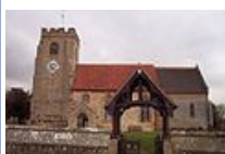
Radford Semele, before and after the fire

Saturday 15th October. Evening Fundraising Concert in aid of the rebuilding of St Nicholas' Church, Radford Semele, Warwickshire, after its total destruction by arson. This will take place in the Village Hall at Radford Semele.